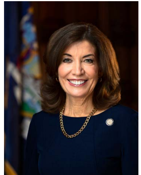
GOVERNOR KATHY HOCHUL

Ranked as the fourth largest city in its own right, boasting attractions like the NY Mets, the US Open, a plethora of museums, and the upcoming NYCFC soccer stadium, Queens holds the potential to emerge as the premier entertainment hub not just within New York City but across the entire US.