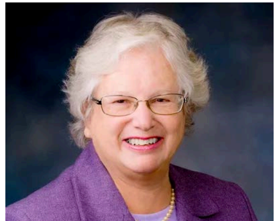
SENATOR TOBY ANN STAVISKY

The purpose of this bill is to increase income eligibility threshold of the tuition assistance program for dependent students. This will make tuition assistance available to more individuals.