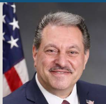
SENATOR JOSEPH P. ADDABBO JR.