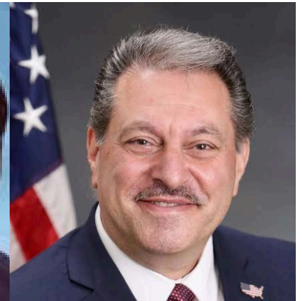
SENATOR JOSEPH P. ADDABBO JR.