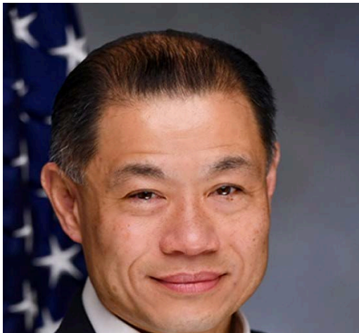
SENATOR JOHN LIU